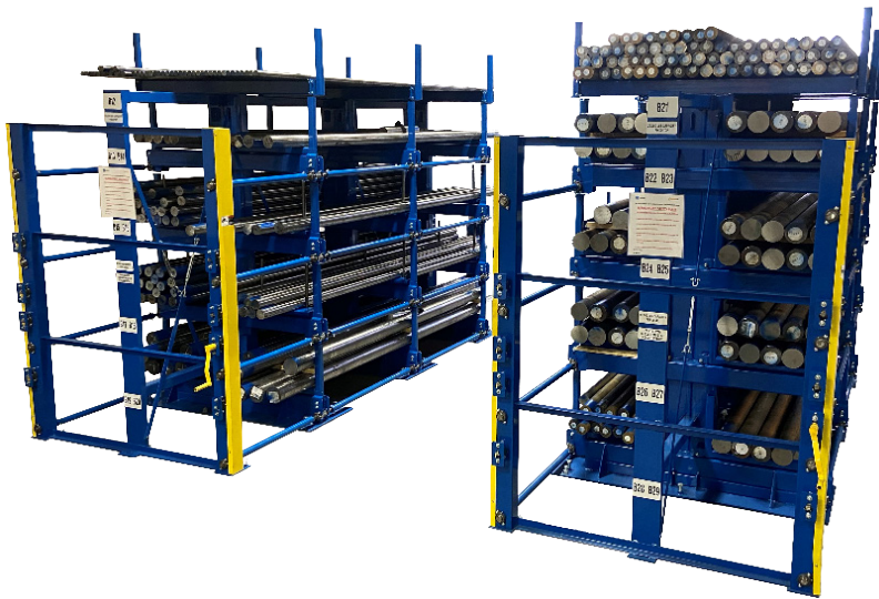
Double Sided Crank-Out Cantilever Loaded