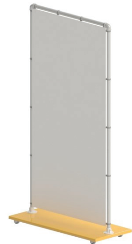
Free Standing Partition