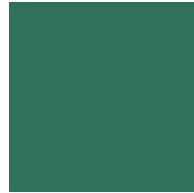
RACK Green RAL 6028