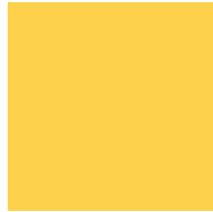
Safety Yellow RAL 1023