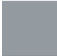
RACK Grey RAL 7045