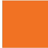
Orange RAL 2004

Colors illustrated may vary slightly from actual paint colors.