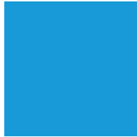
RACK Blue RAL 5012