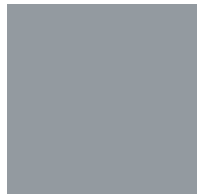
RACK Grey RAL 7045