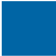
Safety Blue RAL 5017