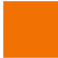
Orange RAL 2004

Colors illustrated may vary slightly from actual paint colors.