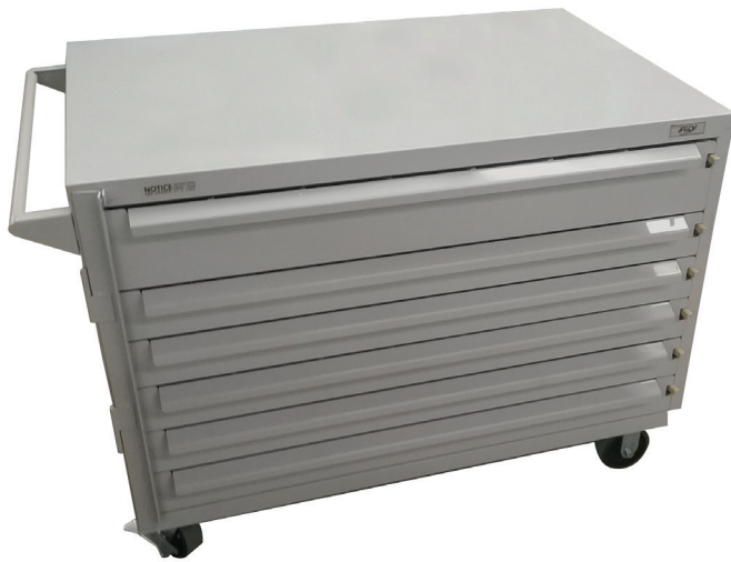
Drawer Style Parts Cabinet Front View

The versatile Drawer Style Parts Cabinet can be customized for specific shapes and sizes of the stored spare parts. Each drawer can be fitted with compartments and dividers for a quick visual of parts on hand. The cabinet is mobile and easily rolls to the work station where it is needed and is designed with safety locking features to prevent drawers from opening during movement. The ergonomic height of the cabinet provides an additional work surface and overall great accessory for the work environment.