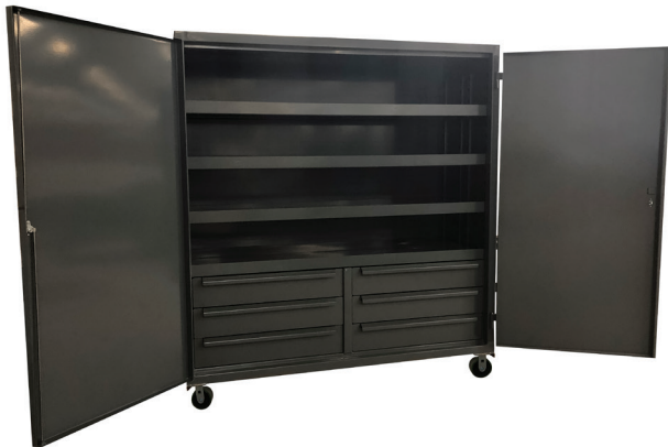
Spare Parts Cabinet Opened Front View