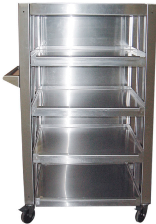
Mobile Utility Cart

Whether the operation needs a stationary storage unit for fixed operations or a mobile design for flexible or on the move operations. Rack Engineering Division can provide a solution. Our engineers are available to design a storage solution with the ability to adjust height, width, depth, type of material, number of drawers or shelves, etc. Stainless Steel storage solutions are used in thousands of different applications for secure containment, organization, and inventory management. Many products can be designed at ergonomic heights providing a built in work surface. Rack Engineering is providing mobile and stationary Stainless Steel storage solutions to meet specific requirements.