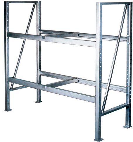
Pallet Rack Storage