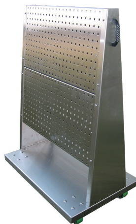
A-Frame Mobile Rack