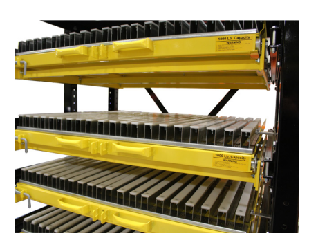
Up to 4,000 LBS Capacity Heavy Duty Shelves