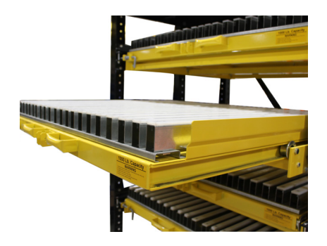
Auto-Lock with 100% Extension Shelves