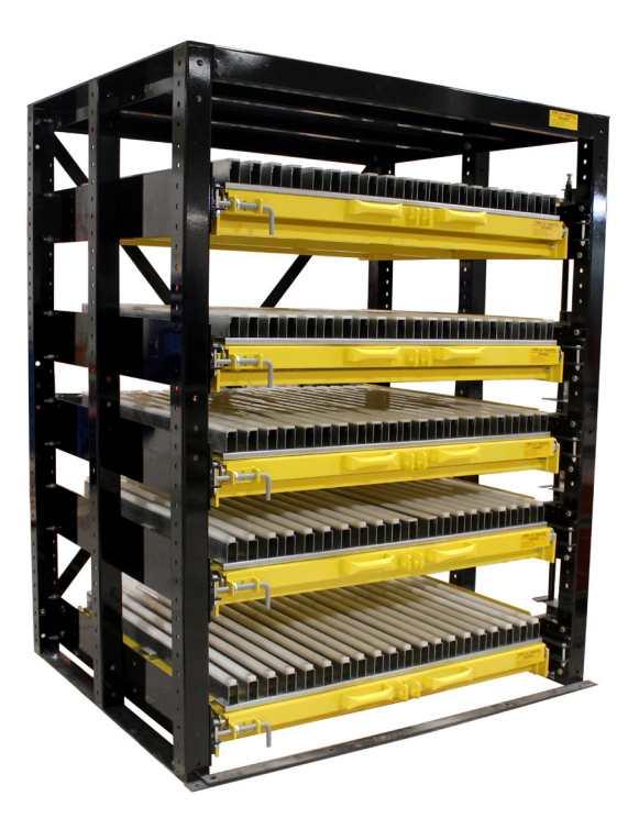
Press Brake Tool Storage System

The Press Brake Tool Storage System provides an ergonomic solution for storing and handling punches and dies at the press brake. The Press Brake Tool Storage System organizes tooling and optimizes production floor space utilizing vertical storage and can improve storage capacity up to 40% or more. The storage system offers configurable shelves that are 100% extendable and accommodate a range of American and European tooling with up to 4,000 pound capacity per shelf. The system also offers safety features such as an optional Auto-Lock Mechanism that prevents the operator from pulling out another shelf while the first shelf is extended.