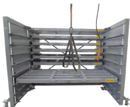
Allows Crane Access to Unload Shelves