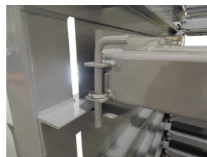
Automatically Locks Open Shelves in Place