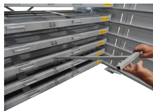
T-handle Provides Ergonomic Assistance to Open Shelves