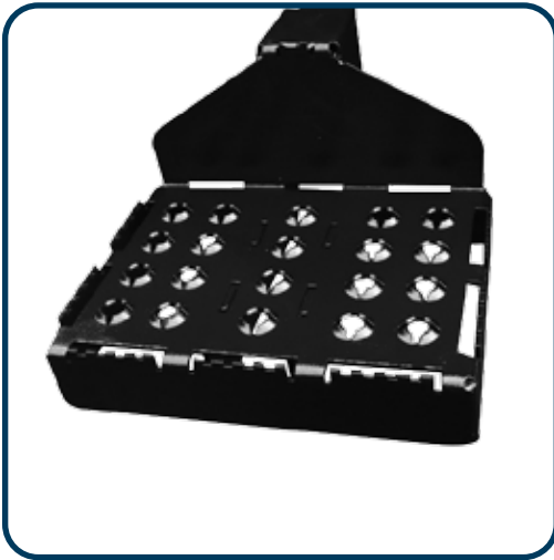
Powder Coated Mild Steel